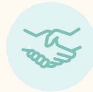
Media relations & industry relations