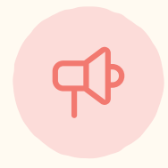
Media & public relations events