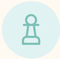
Content & communications strategy