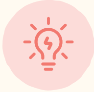
Experience, demo, & innovation centers