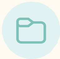
Content & messaging development