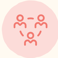
Partner summits & customer round tables