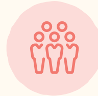
Trade shows & conferences