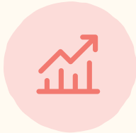
Sales meetings & incentive events