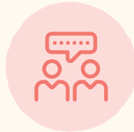
Town halls & employee events